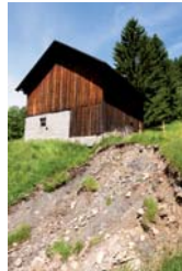
Fig. 1: Shallow landslide in Laterns, Vorarlberg. 19.06.2013

Shallow landslides imminently endanger human living and infrastructure in mountainous regions of the world. As these areas are often densely populated it is essential to fully understand the processes and variables involved in order to prevent impacts.