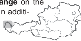
Fig. 2: Location of study areas.

The project aims at determining shallow landslide susceptibility in time and space by means of statistical and physically-based modelling with a high degree of automation. Based on three case studies the influence of climate change on the system status is evaluated. In addition, the effect of landuse change on shallow landslide susceptibility is investigated.